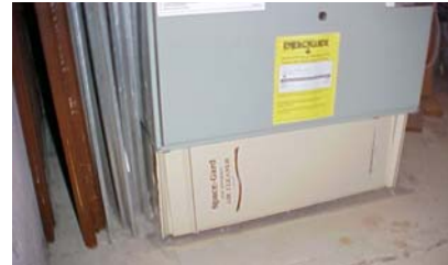
Low pressure drop, high efficiency filter on return of FAU with under-slab return ducts